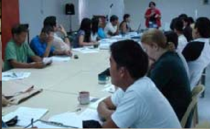
Left: 2nd Interactive Learning Event with focus on Participatory Risk Assessment and Action Planning