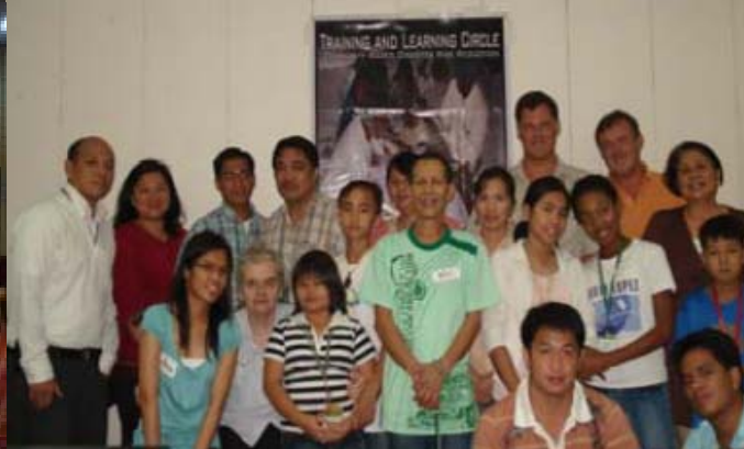
Left: 5th Disaster Management Practitioners Workshop in Phnom Penh, Cambodia. Aside from discussing the CBDRM TLC briefly in 2 presentations, a poster of the CBDRM TLC was exhibited and brochures given out.